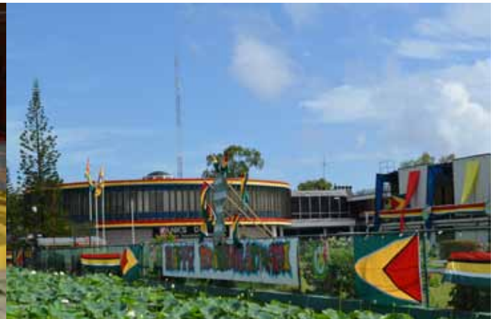
Best decorated building for Mash 2012 - Thirst Park