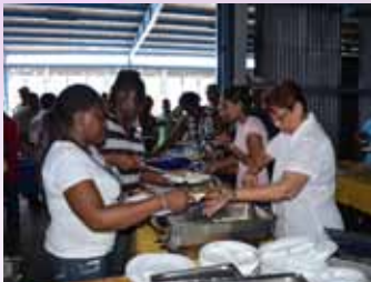
Executives prepare the lunches