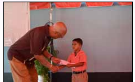
Riverstown Nursery School