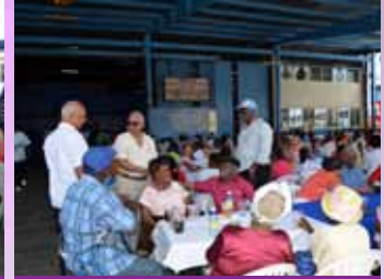
Chairman interacts with invitees