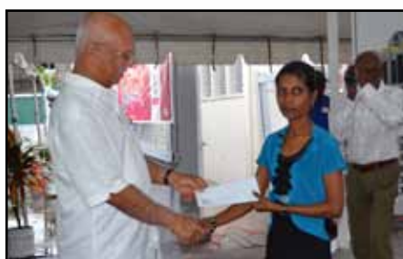
No. 59 Primary School and Winifred Gaskin Memorial Secondary School of Berbice