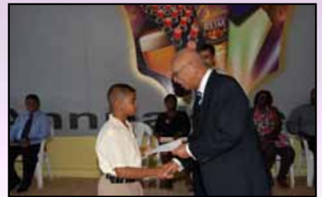
Leonora Primary School