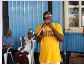
These two singers entertained the gathering.