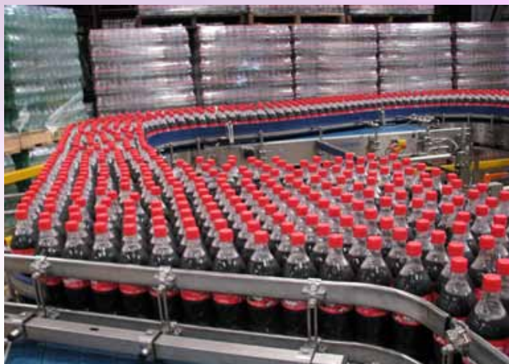
The new soft drink plant

Additionally, a new Filler and Air Conveyor were acquired for the existing Soft Drink Plant.