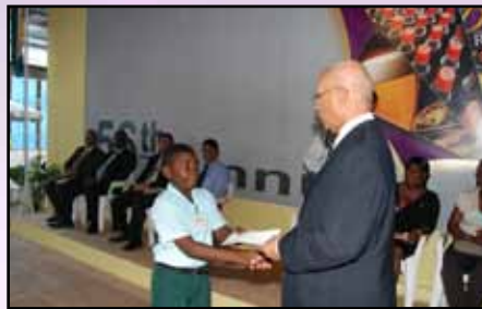
Buxton Primary School