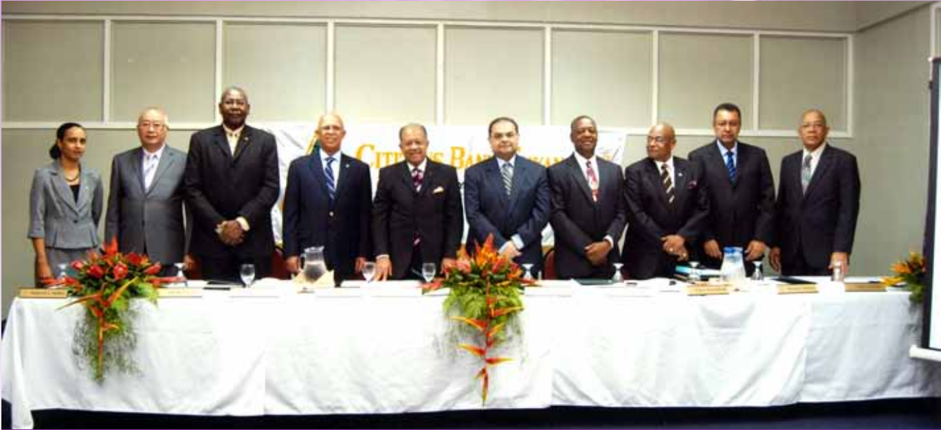
Citizens Bank Board of Directos