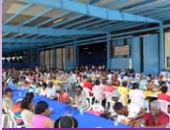
A large gathering at the luncheon