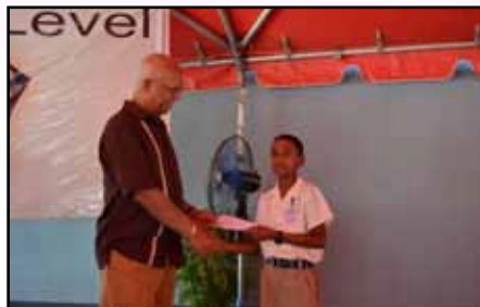
Huist Dieren Primary School