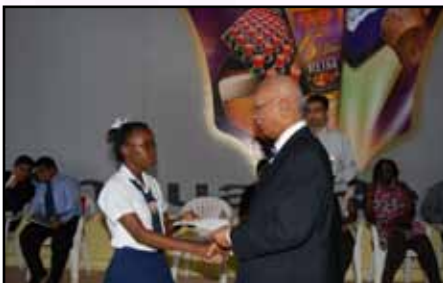
Dolphin Secondary School