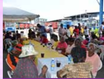
Cool down time!