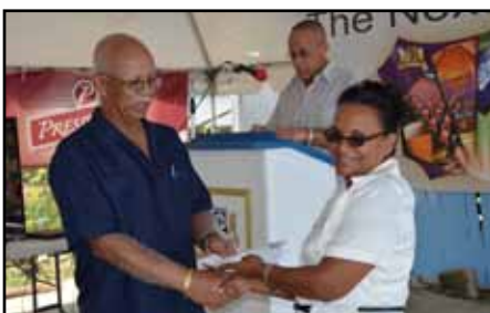
Makouria and St. Mary's Primary Schools of Bartica