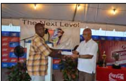
Kwakwani Secondary School