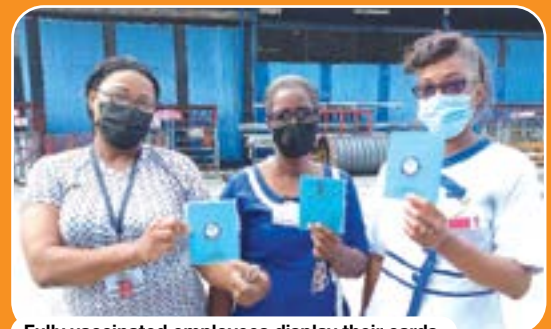
Fully vaccinated employees display their cards.