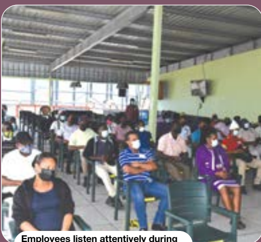
Employees listen attentively during the interactive session.