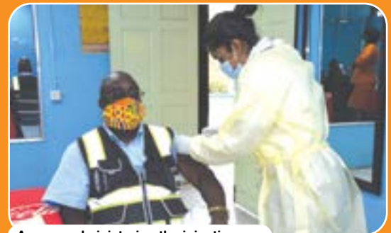
A nurse administering the injection.