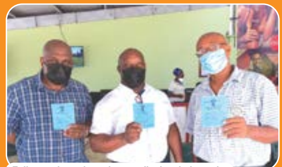
Fully vaccinated employees display their cards.