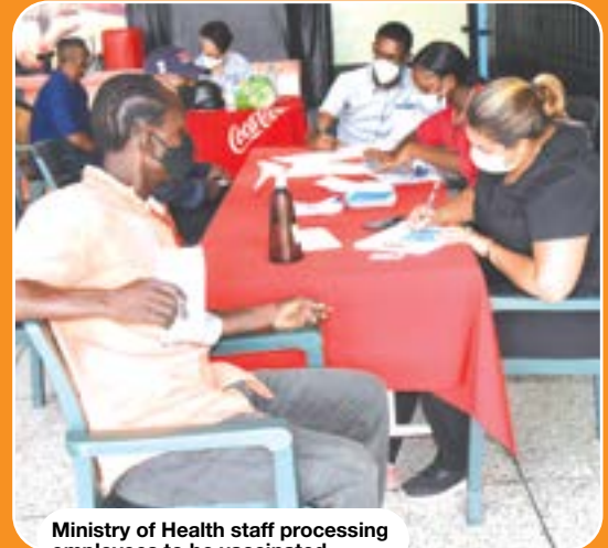
Ministry of Health staff processing employees to be vaccinated.